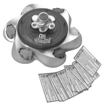
Model G73028 For 1 to 8 player / Ages 6 and up INSTRUCTION MANUAL